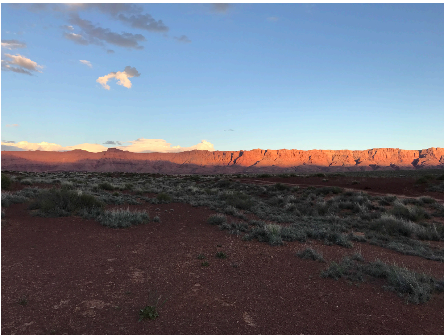
Vermillion Cliffs BLM Land